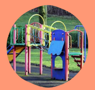
Parks & Landscape Services