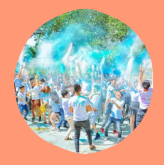
Facilities & Special Events