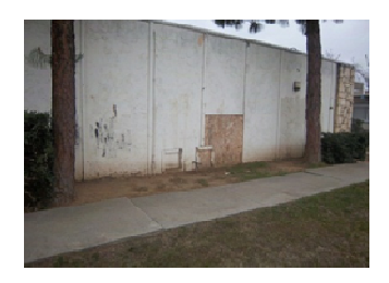
Pre-Rehabilitation Photos for Allies Place

RHDC recently approached the City to support a consolidation/refinancing plan that will convert the current financing of all of the projects managed by RHDC - totaling 44 units throughout Moreno Valley - to a 4% Low Income Housing Tax Credit (LIHTC)/tax-exempt bond deal.