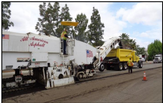
Special Districts Division