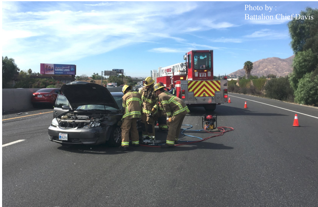
Moreno Valley Fire Traffic Collision