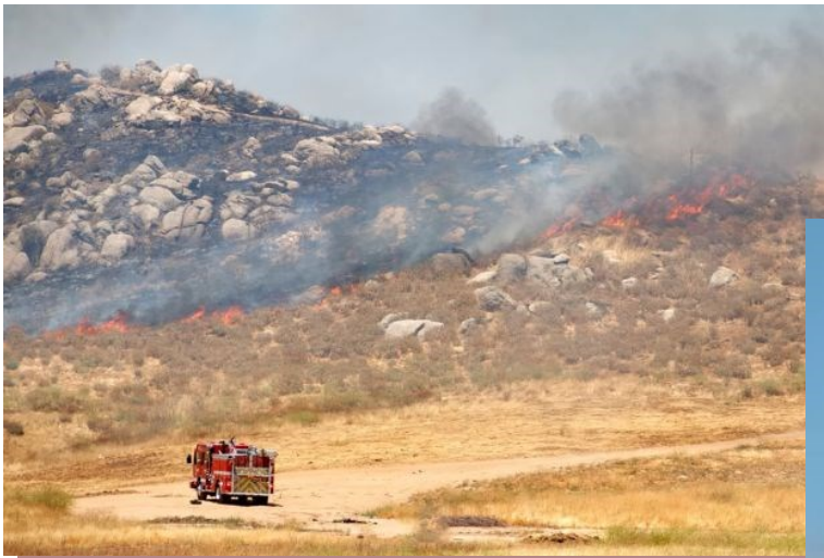
Brush fire near Ironwood Avenue and Moreno Beach Drive in Moreno Valley on May 23, 2017.