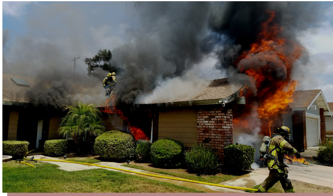
Moreno Valley Fire Garage Fire