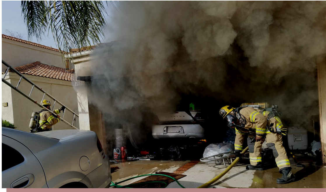
Moreno Valley Fire Garage Fire