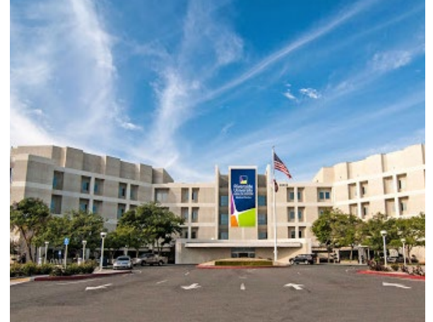
Riverside University Health System Medical Center